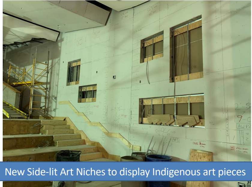
New Side-lit Art Niches to display Indigenous art pieces