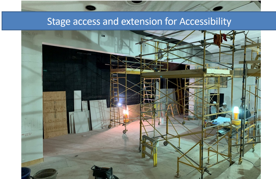
Stage access and extension for Accessibility