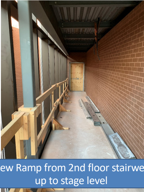
New Ramp from 2nd floor stairwell up to stage level