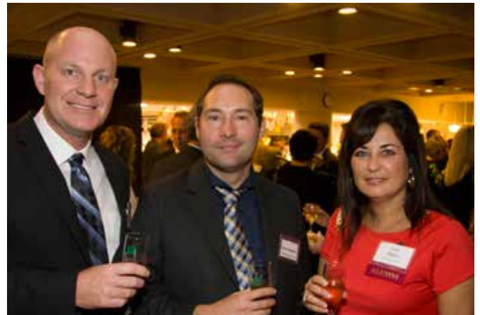
19th annual Community Partners' Evening | Thursday, September 25th, 2014

The presence and participation of over 50 students helped to remind guests that this celebration is all about raising funds to support student success through Entrance Awards.