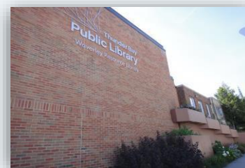
Waverly Resource Library