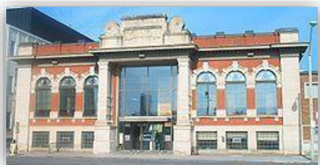
Brodie Resource Library

Emergency buttons like this one are located throughout all buildings at Confederation College