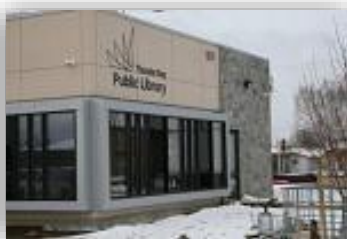
Mary J.L. Black Library