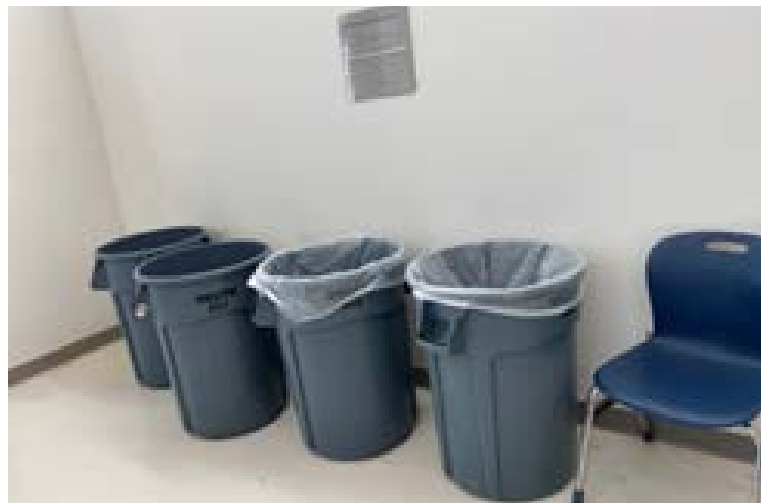
FIGURE 8 - WALK THROUGH AT MCINTYRE BUILDING SHOWED US THESE BINS, WHICH WERE USED DURING AN EVENT, BUT HAVEN'T BEEN TAKEN BACK TO STORAGE YET.

The menus at all cafes should include that there's a discount for using a reusable mug when purchasing lattes or coffee.