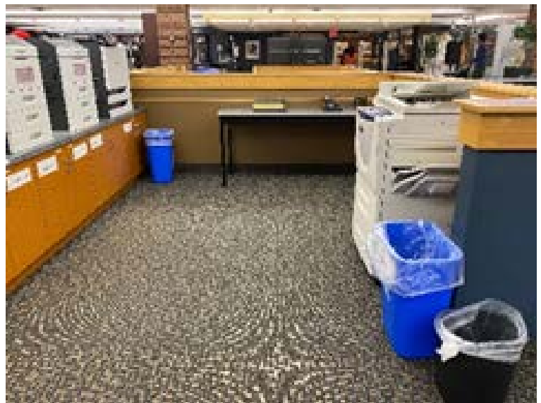
FIGURE 12 - THE LIBRARY IN SHUNIAH BUILDING HAD MANY SINGLE STREAM BINS ACROSS THE FLOORS.

All bathrooms should only utilize hand driers, rather than paper towels, our recommendation is to remove paper towel dispensers, and install hand driers in all bathrooms without them. Remove all garbage bins from bathrooms as well, other than small bins inside the stalls.