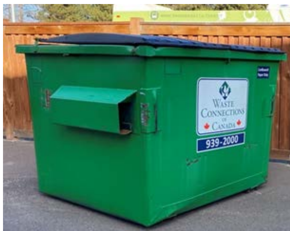
FIGURE 3 - EXTERNAL BINS FOR CARDBOARD, PAPER AND WASTE.