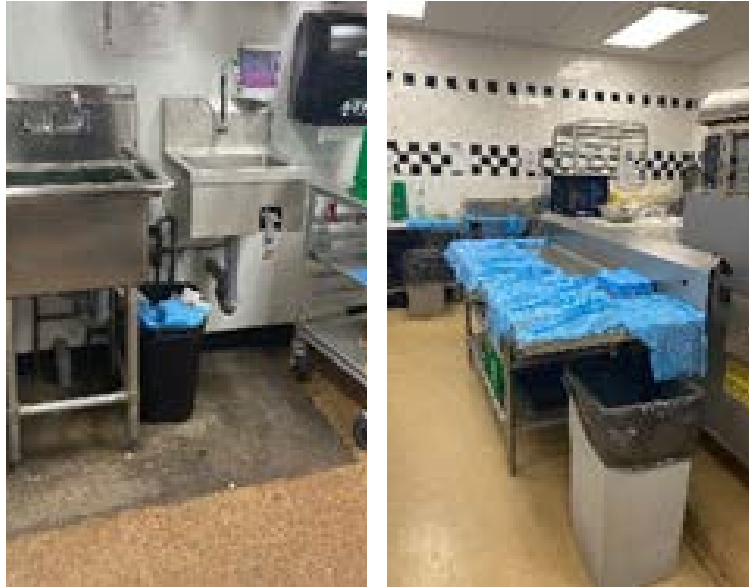
FIGURE 9 - BOTH PHOTOS DEPICTED ARE FROM BACK OF HOUSE KITCHENS ONLY UTILIZING GARBAGE BINS FOR WASTE REMOVAL.