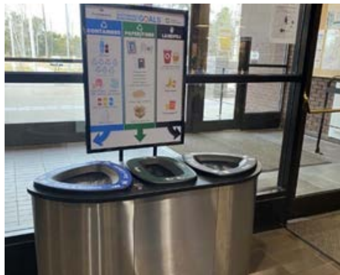
FIGURE 4 - 3 SORTER BINS UTILIZED ACROSS CAMPUS IN BUSY HALLWAYS.

Place clear signage on the actual bin, on all sides of it. This specific bin in the photo is strictly for cardboard and paper only and should have clear signage with what is accepted and not accepted into the stream. There should be specific signage on what isn't permitted, for example liquids, food, or garbage of any type. Staff members from across Confederation College utilize these bins, so there should be clear instructions for each one of them across campus.