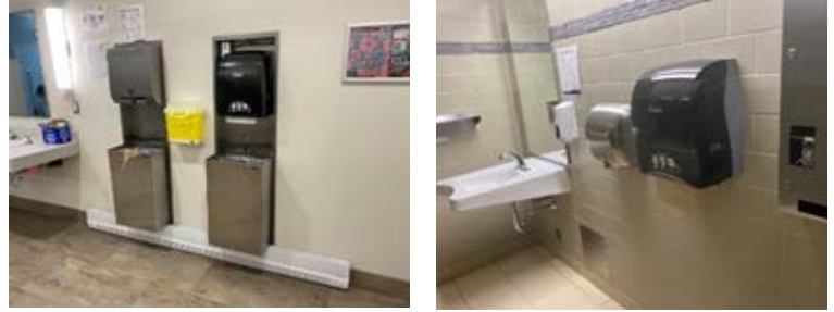
FIGURE 11 - BATHROOMS ACROSS THE CAMPUS HAVE EITHER BOTH HAND DRIERS AND PAPER TOWEL DISPENSERS, OR JUST PAPER DISPENSERS.