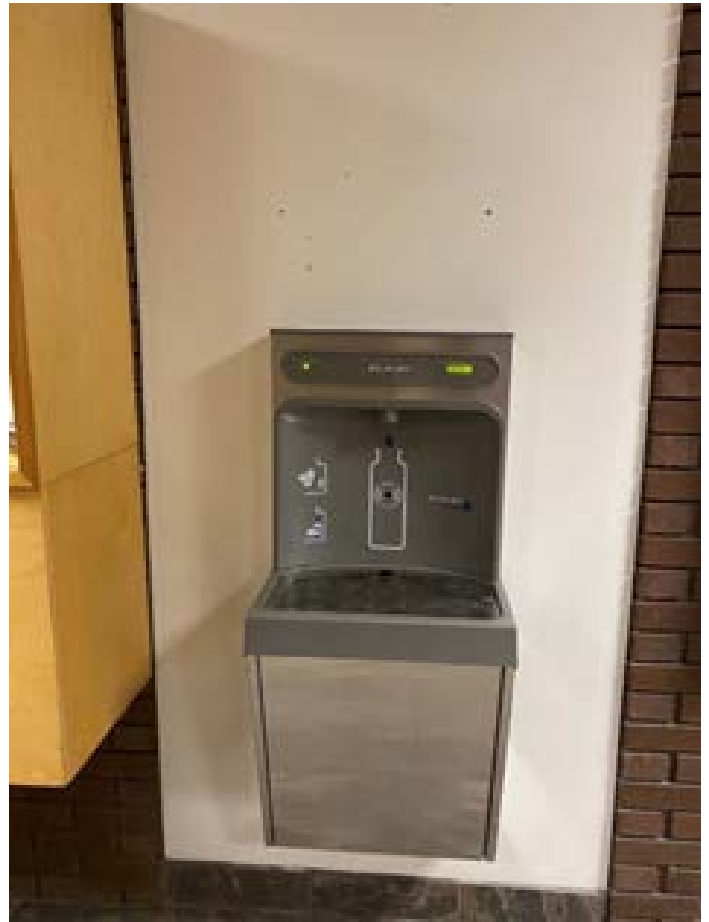
FIGURE 6 - WATER RE-FILL STATION, ACCESSIBLE ON SOME AREAS ACROSS CAMPUS.