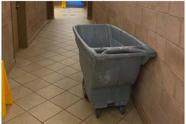
FIGURE 10 - FOOD LABS AND KITCHENS BIN FOR COLLECTING GARBAGE THROUGHOUT THE DAY.

Placing 3 sorters (landfill, recycling and organics) in all of the kitchens, should be useful for chefs and cooks to place their waste into. Currently there are mostly garbage bins laid out everywhere, taking plastic waste, paper towels, food waste, and everything else.