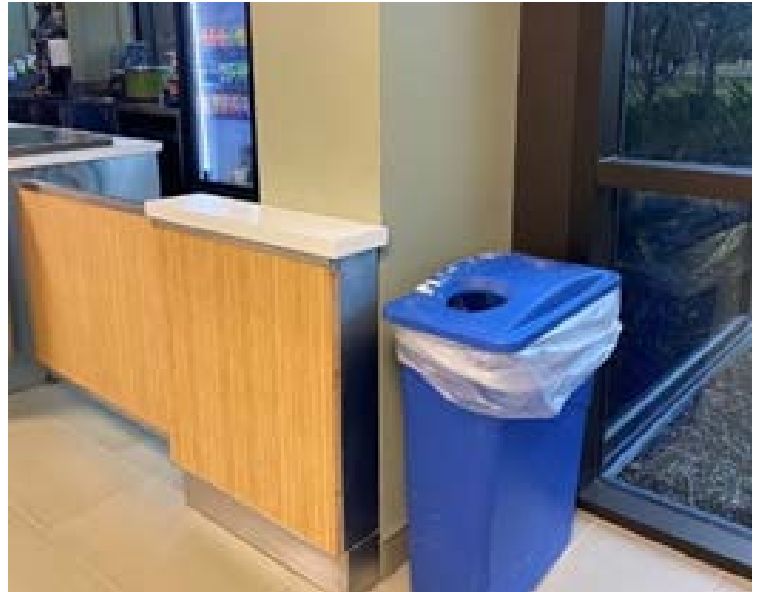
FIGURE 7 - SINGLE STREAM BIN BY THE BAABAASHI GIBICHII CAFE IN SHUNI-AH BUILDING, WHICH IS SITTING RIGHT ACROSS FROM A 3-SORTER BIN.