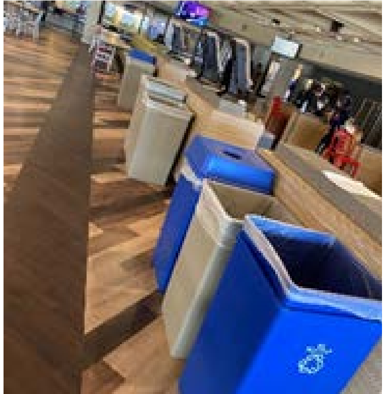
FIGURE 13 - SHUNIAH BUILDING CAFETERIA UTILIZING SINGLE STREAM BINS ACROSS THE HALL.