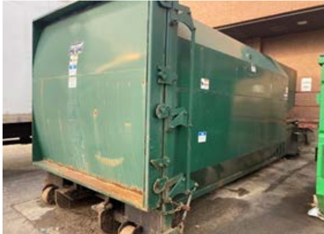
FIGURE 5 - A COMPACTOR AT THE SHUNIAH BUILDING, WHICH HAS NO SIGNAGE OR CLEAR IDENTIFIERS ON WHAT IS ACCEPTED.